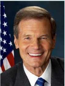
Sen. Bill Nelson