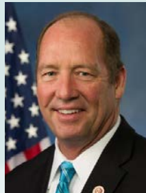
Rep. Ted Yoho District 3