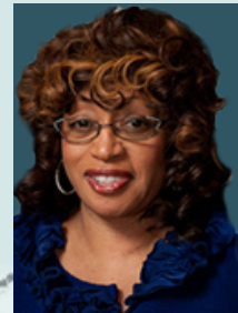
Rep. Corrine Brown District 5