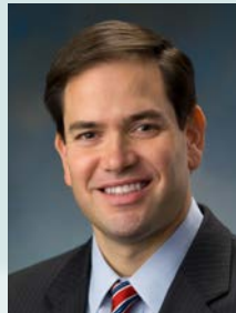
Sen. Marco Rubio