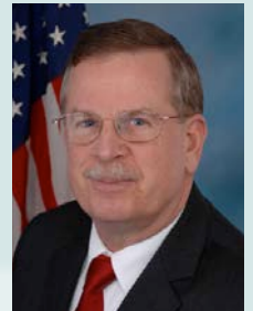
Rep. Richard Nugent District 11