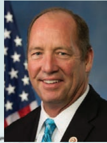
Rep. Ted Yoho District 3