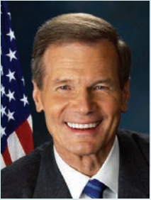
Sen. Bill Nelson