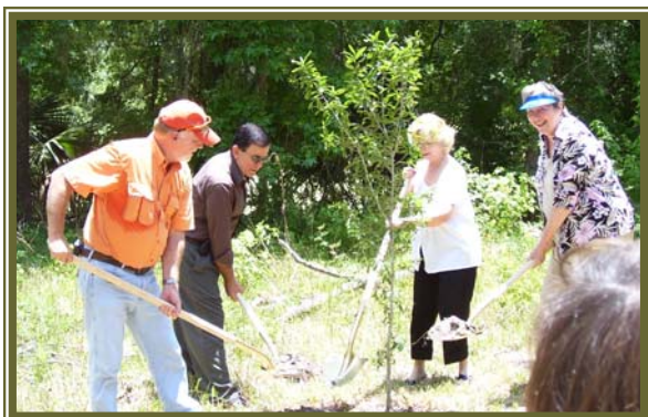
The City of Dunnellon officials plant an oak tree to celebrate the acquisition of Blue Run of Dunnellon Park on June 13.

The City of Dunnellon has partnered with Marion County to acquire a 33-acre parcel of land adjacent to