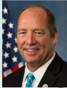
Rep. Ted Yoho District 3