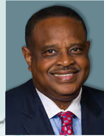
Rep. Al Lawson District 5