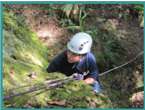
Extreme Adventure Campers rappel at the Brick City Adventure Park quarry.

To learn more about this and other Marion County recreation areas, visit www.marioncountyfl.org/parks.htm or call 352-671-8560.