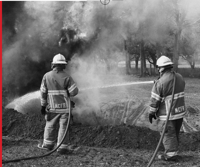
FIREFIGHTERS EXTINGUISH AN ILLEGAL FIRE IN SOUTHWEST MARION COUNTY.